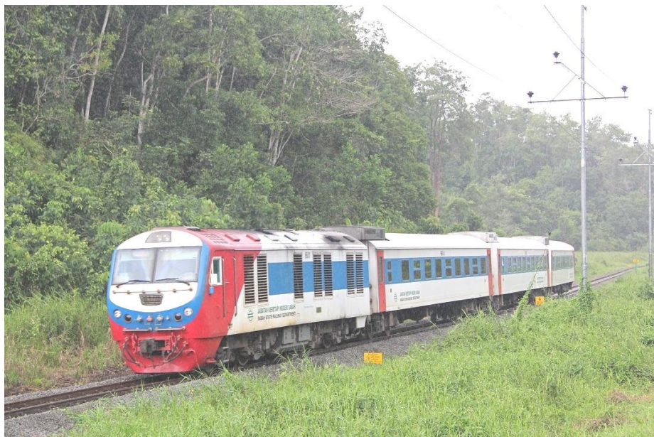
DMU near Kawang