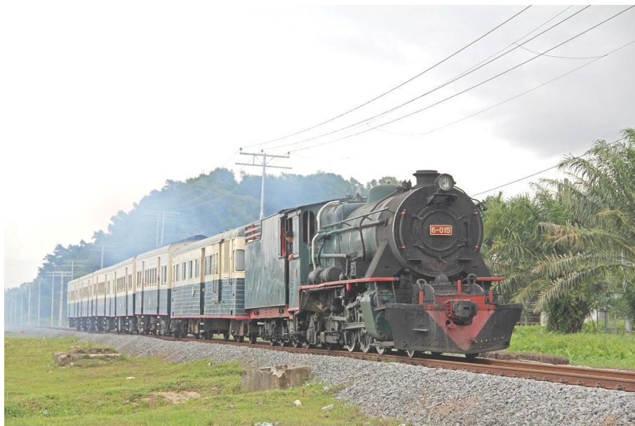
6.015 near Tanjun Aru