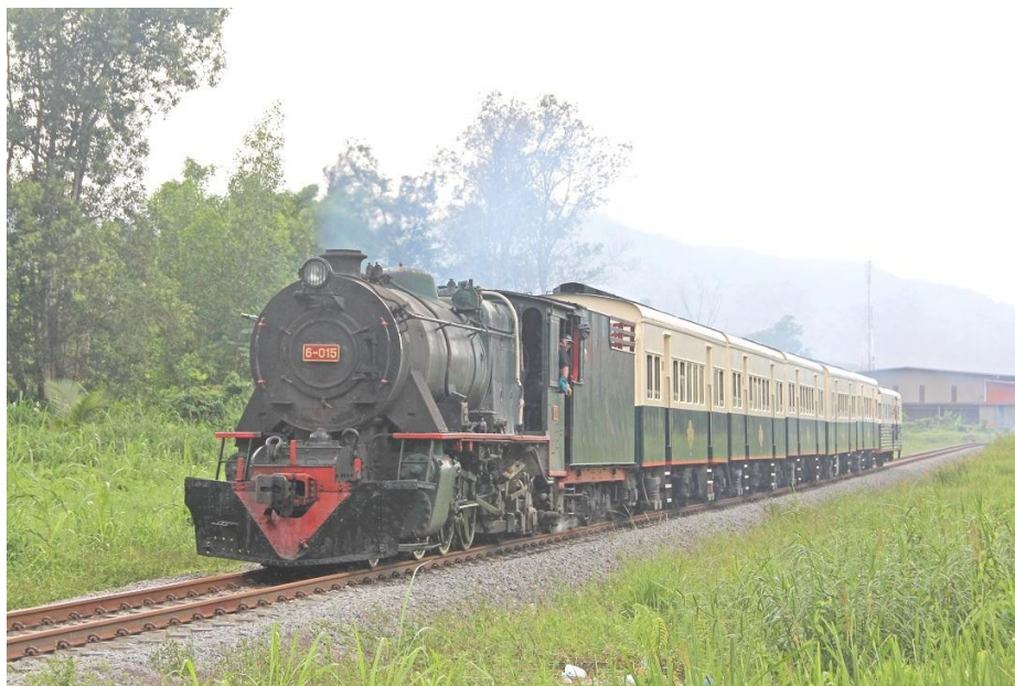
6.015 near Kawang