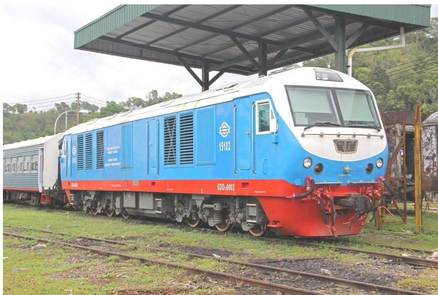
15102 at Tanjun Aru