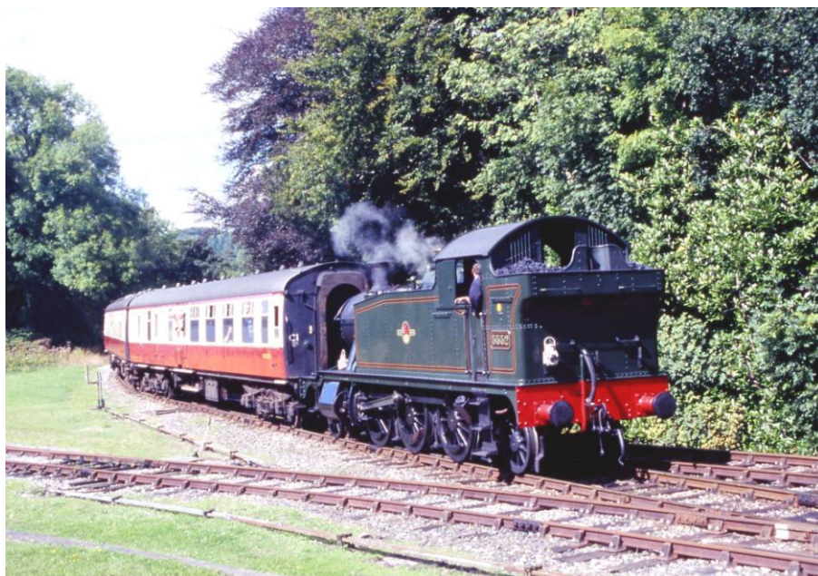
GWR 2-6-2T 5552 Bodmin Parkway 29th Aug 2011