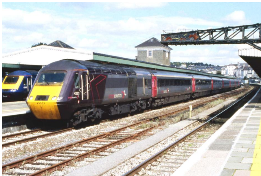
43 321 Plymouth 31st Aug 2011